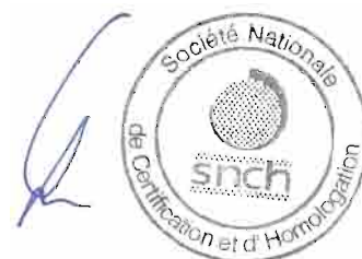
Gilles AST expert technique